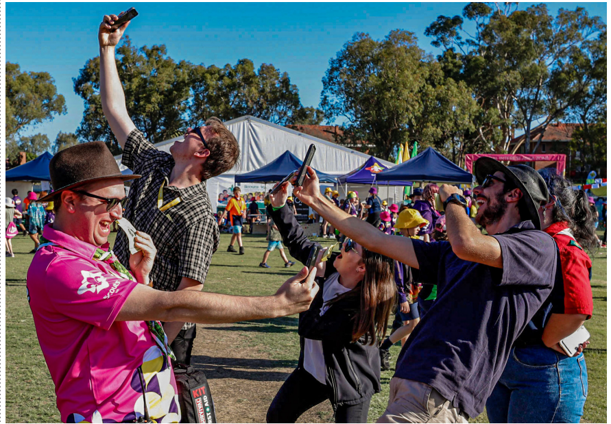
A group quickly stop to post their BeReal.

IS there ever a more perfect time for BeReal to go off? How about in the middle of One Program Day. That's what happened yesterday, during the market stalls. Many people on the oval stopped to capture their BeReal within the two-minute time frame. Once everyone was done, they returned to their normal activities and hundreds of near identical BeReal's were posted. One leader said, "I was off site at the time, so my BeReal was just me at Bunnings. But I was soon seeing posts from everyone back on site."