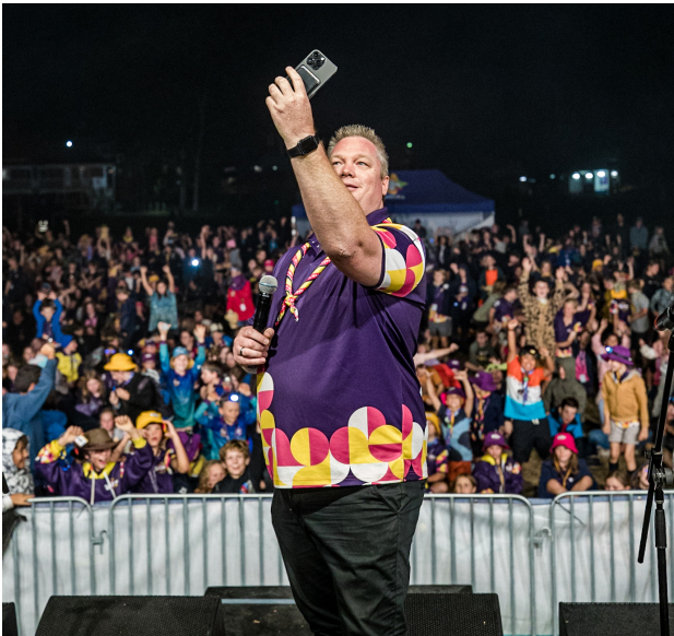
THE Chief Commissioner had to take a quick selfie after his closing speech.