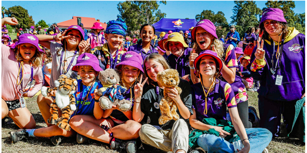
One Program day was all about fun...and teddy bears, according to this group of youth.

The vibe and joy of the day was infectious for leaders and adult volunteers who are tired beyond tired, yet somehow dig deeper with a commitment to empowering and enriching children, and who have a sense of deep responsibility for the Scouts entrusted in their care. And it was the peak of the final mountain for the organisers who have spent two years organising this Australia-first camp.