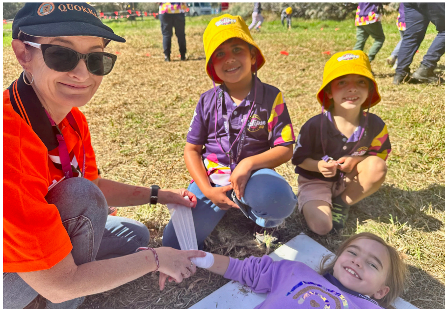
Helping a Scout who was bitten by a T-Rex.