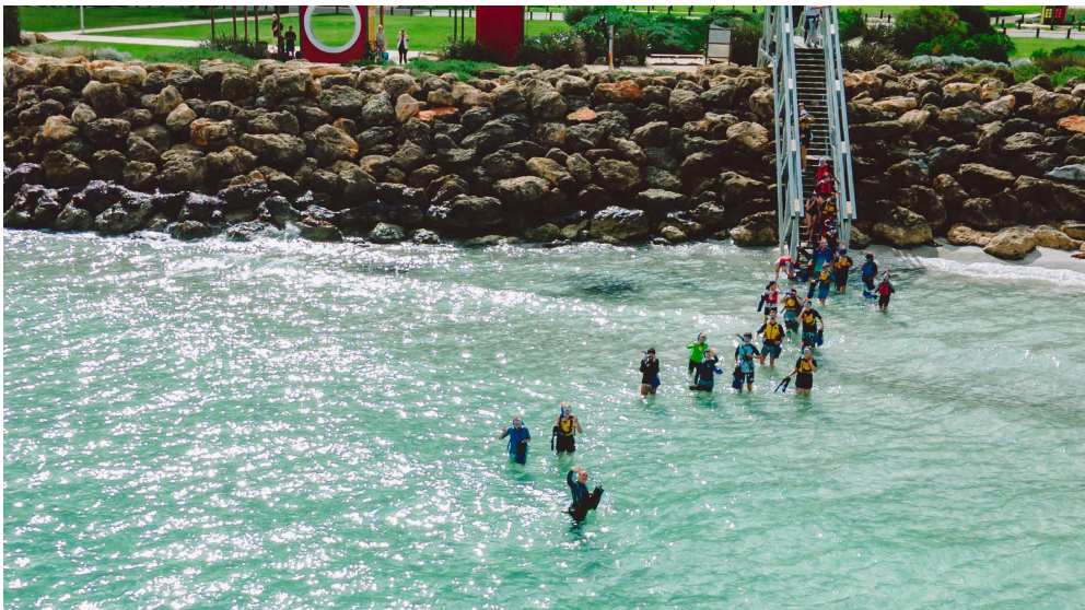
Scouts prepare to explore the Omeo Wreck.

SCOUTS and Venturers were lucky enough to get some nicer weather yesterday for a trip to Coogee Beach for the Snorkeling adventure. Reports say that yesterdays weather, although cold, was much nicer than what it has been for the last few days . The Scouts were able to check out the wreck and sea life, thanks to much clearer visibility. Hopefully the weather remains nice for the other Scouts that are yet to do the activity.