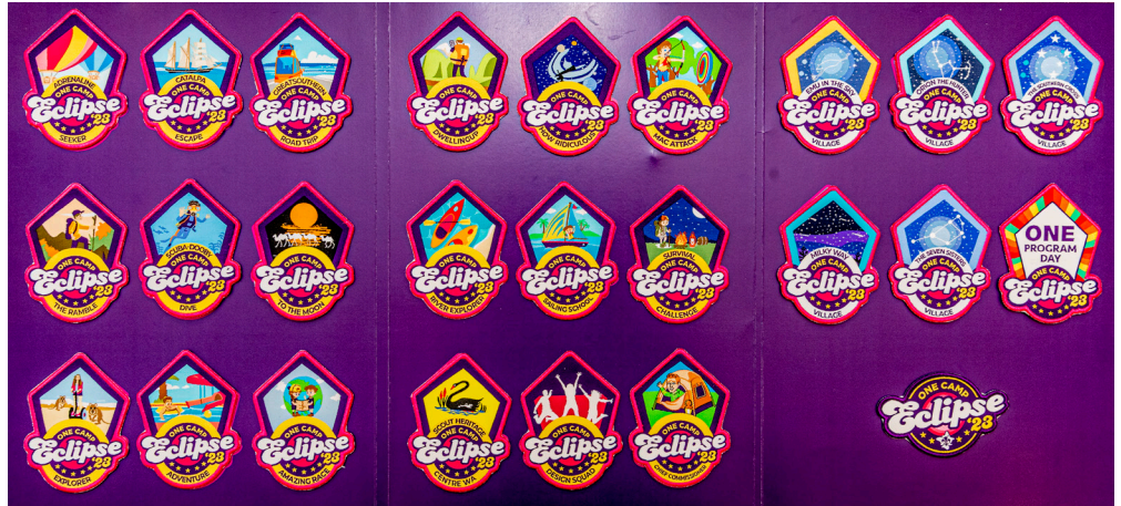
Special release - The Limited Edition OneCamp Badge Set.

Pre-sales will open today at 7pm at The Hub shop. Remaining sets will go on sale at 10am on One Program Day at The Hub shop.