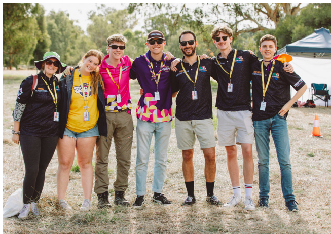
Venture24 team visit The Field

We also have the from Scouts Victoria's Venture24 team, here to promote the event to potential participants.