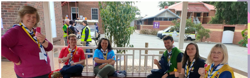
National Youth Program Team helping us get through some of our ice creams.