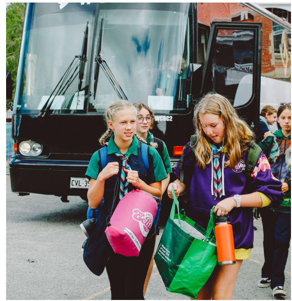
Scouts getting off the bus ready to check in to site.