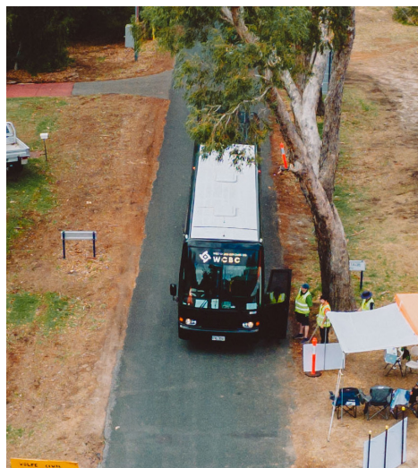
Bus arrives and checks in at the front gate as it comes on site at OneCamp.