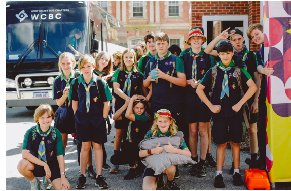
A Unit of Scouts fresh of the bus ready for One Camp.

Scouts off site for their mini expedition of an adventure day. We all think that its safe to say, we are going to lose count of the number of buses that come and go from the OneCamp site, especially as we will do it all again when the Cub Scouts come on site, and when the Joey Scouts join us on Monday.